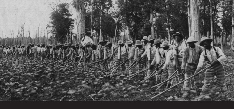
Prisoners hoeing in a field at Parchman Farm, Mississippi, ca. 1930s.

most of whom were black. The prisoners entered cotton fields before dawn to work the land, and trusty guards watched over the men, guns in hand.